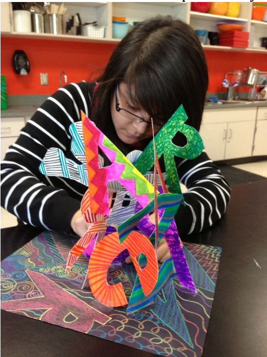
Same idea but with the letters of their name