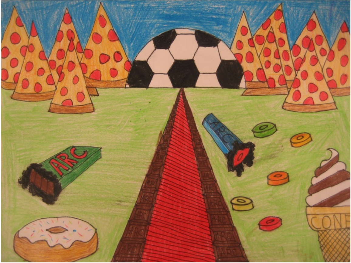
Sculpture lesson ideas