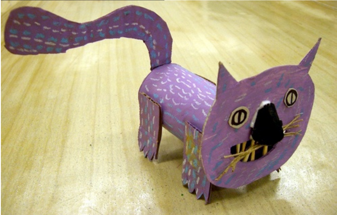
Recycled animal sculptures