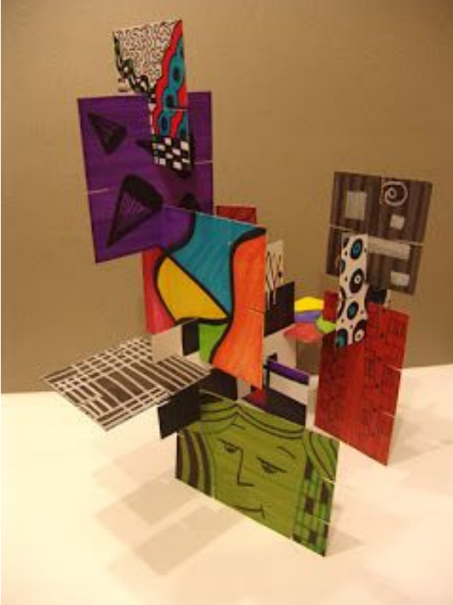
Cardboard assembled sculpture- recycling Emphasize the elements of art