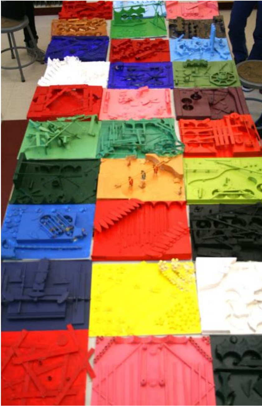
Louise Nevelson monochromatic assemblage relief sculpture, emphasis on recycled art, repurposing